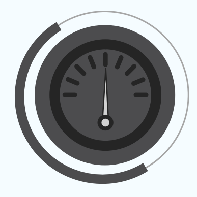
Faster delivery on critical business tasks, like backup and restore SLAs.